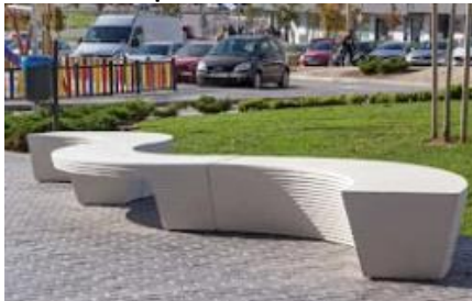
Bench Concept 5